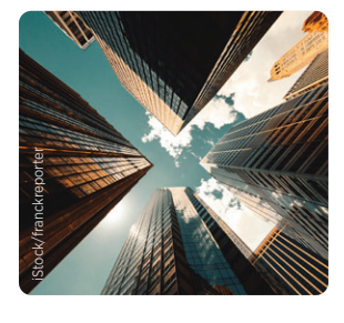
PROPERTY AND BANK ACCOUNTS

How your residence status defines the way you are taxed on income, gains and inheritance