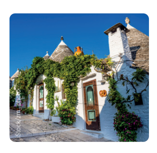
TAX AS A NON-RESIDENT

How your residence status defines the way you are taxed on income, gains and inheritance